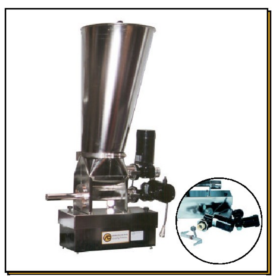
Constructed of electro-polished stainless steel, the PF Series Powder Feeder from PROCESS CONTROL delivers unparalleled accuracy. (Shown above is a PFC20)

The PF Series Powder Feeder from Process Control offers operators unprecedented metering accuracy from ultra low rates up to 1.360 kilograms per hour.