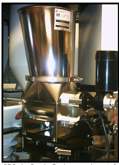
PF Series Powder Feeder as an element of a gravimetric blender