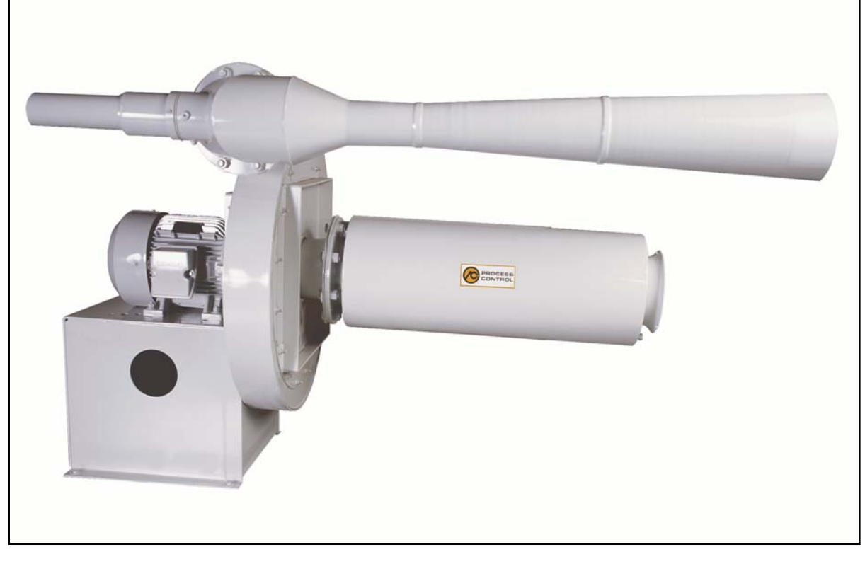
The IN Series: trim removal component for use with asr® systems to recycle edge trim, roll scrap and loose scrap individually or simultaneously (pictured above is an IN 415)

PROCESS CONTROL's IN Series Inducers are designed to pick up and convey edge and / or bleed trims generated in the production of plastic film or other thin-gauge products such as foam, tape, paper or foil. These continuous trims are picked up by suction, conveyed into the inducer's venturi section and blown to a destination such as a PROCESS CONTROL film grinder or a waste container.